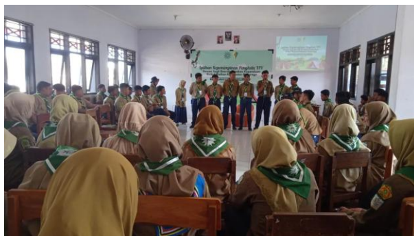
Figure 1. LKP activities (Dokumentation 2024)

The nature tadabbur activity was carried out on the second day in the form of a long march starting from the departure start in the Sukun base area, Pulung Subdistrict to camp-1 in Sawah Lungguh Puduk Subdistrict, continuing to the last post in the Tanah Goyang camping area Puduk Subdistrict, this long march route covered a distance of approximately 24 KM.