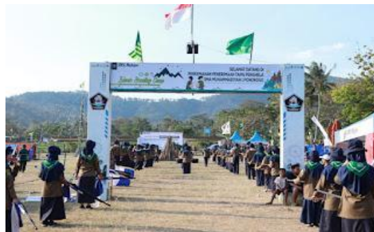
Figure 2. Implementation of ISC at Muhammadiyah 1 Ponorogo High School (Documentation, 2024)

In accordance with our theme of forming students with character, the student scouting event reflects the character of discipline. Islamic values can be applied in daily life, both in interactions with fellow humans, animals, and the environment. This will later shape their character in daily life that is embedded in children, Fajar Andika explained.