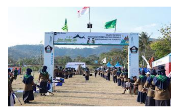
Figure 2. Implementation of ISC at Muhammadiyah 1 Ponorogo High School (Documentation, 2024)

In accordance with our theme of forming students with character, the student scouting event reflects the character of discipline. Islamic values can be applied in daily life, both in interactions with fellow humans, animals, and the environment. This will later shape their character in daily life that is embedded in children, Fajar Andika explained.