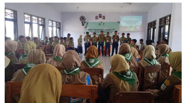
Figure 1. LKP activities (Dokumentation 2024)

The nature tadabbur activity was carried out on the second day in the form of a long march starting from the departure start in the Sukun base area, Pulung Subdistrict to camp-1 in Sawah Lungguh Pudak Subdistrict, continuing to the last post in the Tanah Goyang camping area Pudak Subdistrict, this long march route covered a distance of approximately 24 KM.