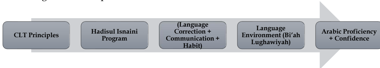
Figure 1. Conceptual Framework of Hadisul Isnaini as CLT-Based Model

In terms of novelty, this study proposes that Hadisul Isnaini represents a “habitual communicative curriculum model”, where language learning is embedded in routine activities, social interaction, and institutional culture. This model goes beyond traditional CLT by integrating three key elements: (1) systematic language correction, (2) communicative practice, and (3) environmental reinforcement. Such integration provides a more holistic approach to language learning, particularly in contexts where language is expected to function as both a medium of instruction and daily communication. Therefore, this study contributes not only to the theoretical development of CLT but also