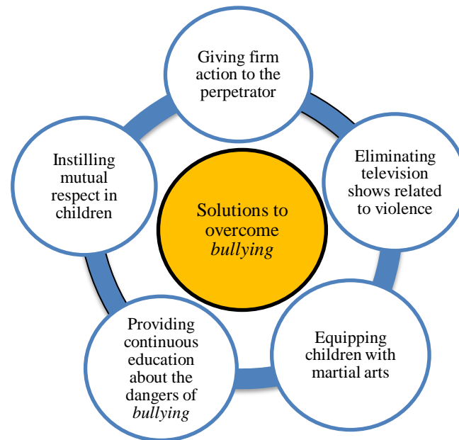
Figure 2: Description of solutions to overcome bullying

Six solutions offered from bullying behavior as seen in Figure 4 above, the authors get from informants when direct interviews are conducted. This information was conveyed by the informants in slightly different languages, but had the same